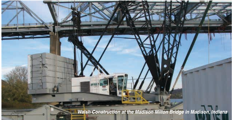
Walsh Construction at the Madison Milton Bridge in Madison, Indiana

Walsh Construction and Aquarius Marine are working at the Madison-Milton Bridge in Madison, Indiana. Several of our contractors are still working at the Clifty Creek Power Plant in Madison, but this job is winding down. ICI Skanska has a small shutdown at Tanners Creek Power Plant in Lawrenceburg, Indiana. The Event Center in Lawrenceburg, IN is finally underway, with Nelson-Stark doing the site work and underground utilities. This job is being done under a Project Labor Agreement; all contractors must sign and abide by the conditions of the PLA. Lykins Contracting is doing some work in Greendale,