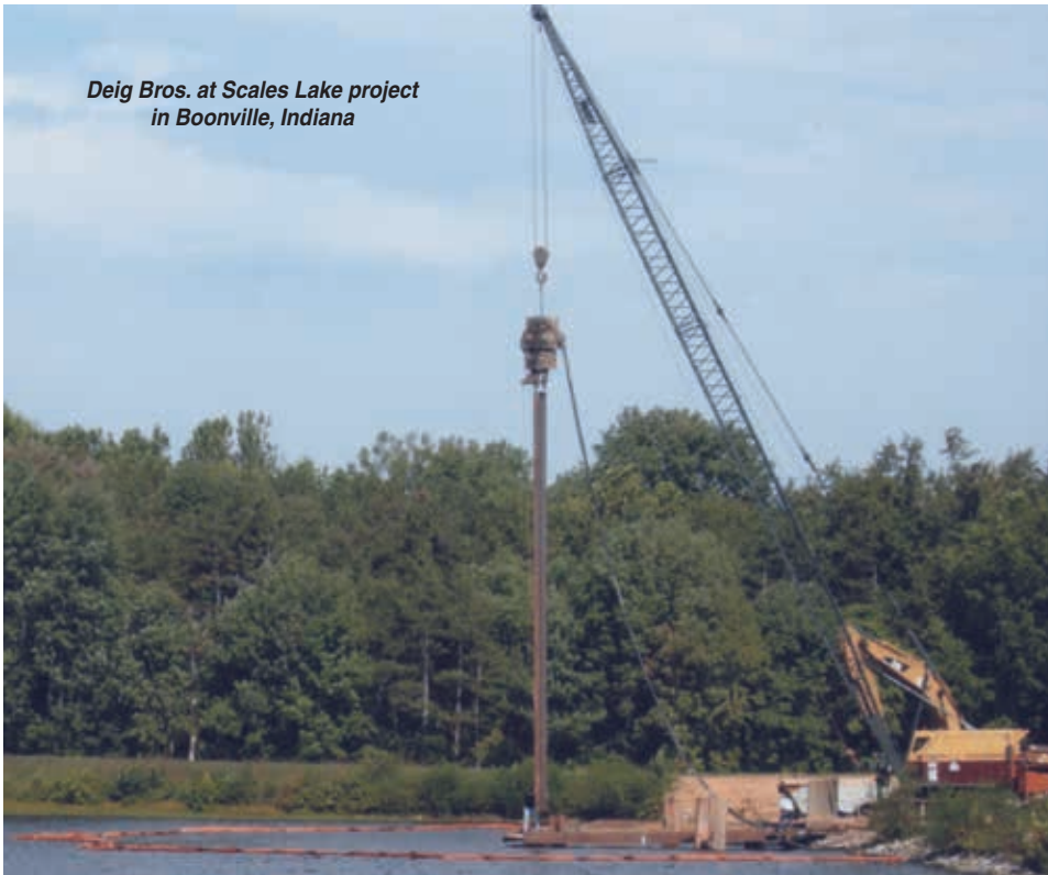
Deig Bros. at Scales Lake project in Boonville, Indiana

If we can be of assistance, please stop by the office or call 812-474-1811. ♦