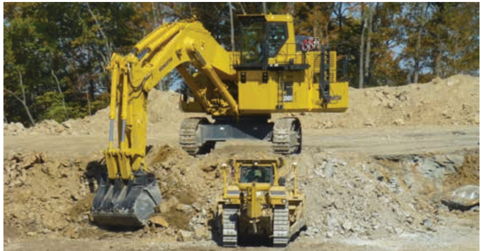
Kokosing Highway project in Pikeville, Kentucky

We would like to remind you to attend your monthly union meeting (except June and December); which are still held at the Ironworker's Hall. By now everyone should know that the District Six office has moved. We are located in the Hoy Plaza. The address is 1454 Diederich Blvd., Russell KY 41169 and our phone number is 606-833-0005. In closing, we want to wish everyone and their families a Merry Christmas and Happy New Year. ♦