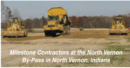
Milestone Contractors at the North Vernon By-Pass in North Vernon, Indiana

Bruns-Gutzwiller and Dunlap Contracting have both picked up jobs in our area as General Contractors as well as self performing some of the work. Wilhelm Construction and Force Construction are working in Columbus, IN installing flood walls at two of the Cummins Plants. Mitchell and Stark have sub-contracted some of the work from Force on this project. At the present time Huelsman-Sweeney is working at the Cummins Plant in Seymour, Indiana.