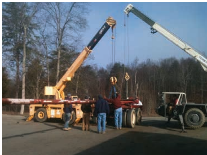
Boston Apprentices loading pipe trailer after Vacuworxs Class wrapped up