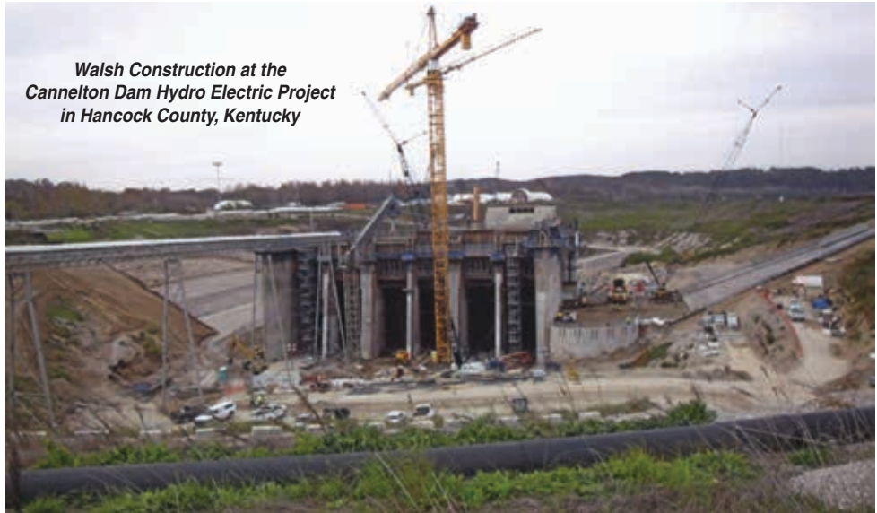
Walsh Construction at the Cannelton Dam Hydro Electric Project in Hancock County, Kentucky

In Union County, Deig Brothers continues to work on a $3.1 million storm water and sanitary sewer separation project in Morganfield which should last through the