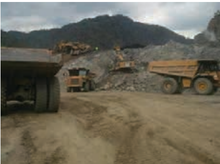
Hi-View highway work in Elkhorn City, Kentucky

may be the slowest we have seen. We have 4 ongoing Highway projects in Martin and Pike Counties, with contractors Kokosing and Hi-View that have peaked with approximately 70 operators this summer. The weather has slowed the projects down, but we hope the weather allows them to pick back up. We have several Highway projects in District Six that are scheduled to bid in the coming months; for the first time in many years IUOE Local 181 Heavy & Highway rates are the Prevailing Wages in the District Six area. This should bring an increase in union contractors bidding on work in our area and getting more people working.