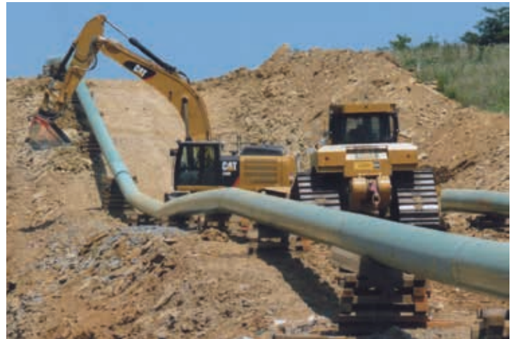
Local 181 Operators working on Marathon Pipeline with Welded Construction in various counties in District 4